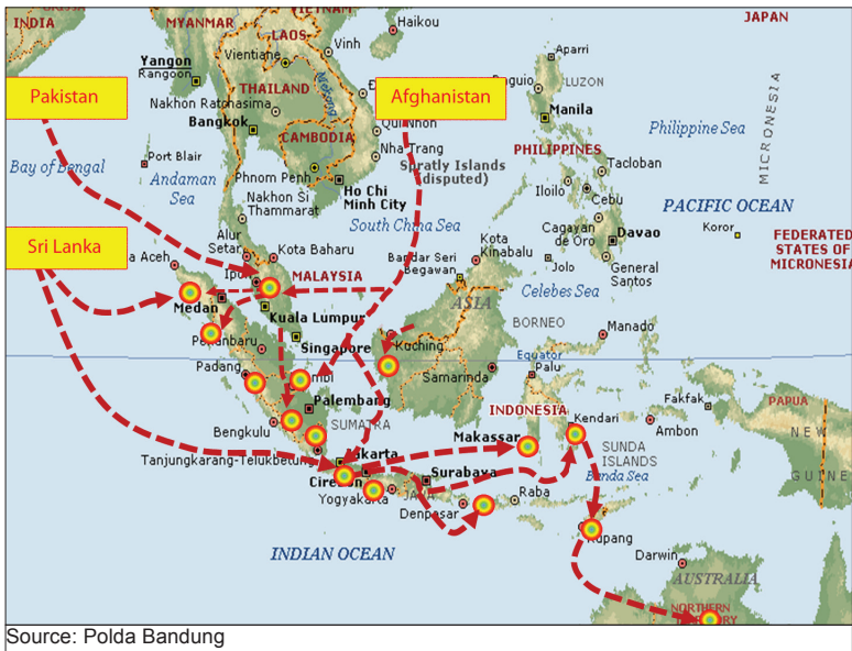
Map 1: Common People Smuggling Routes in Indonesia